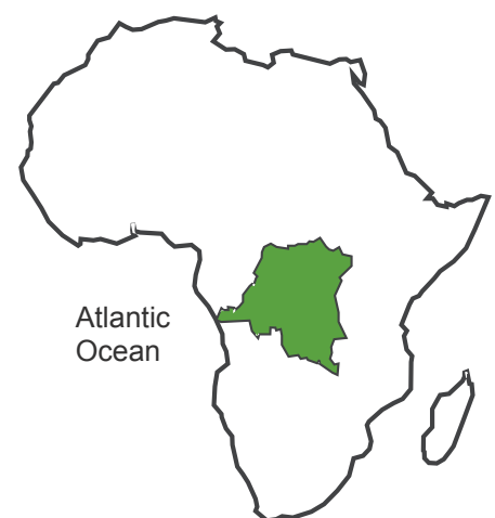
DRC location in Africa