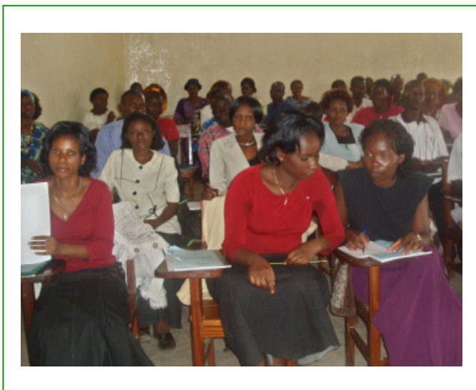
University students at Bunia in 2008

On September 5th 2002, CME, which for the most part had been un-touched directly by the wars, was attacked. Within half an hour, 1000 people were murdered including patients, hospital staff and villagers. After days being held hostage at Nyankunde, the remaining patients and staff fled on foot. Most travelled south, walking for two weeks through the rain forest with nothing but the clothes that they were wearing. Mercifully, no more died and 4 babies were born en route! Nyankunde became a 'ghost-town' and the medical centre was looted and largely destroyed.