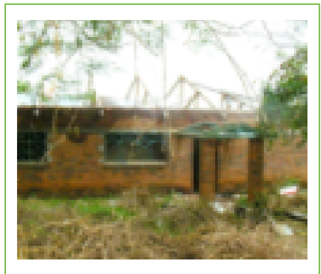
Derelict Pharmacy at CME Nyankunde in 2002