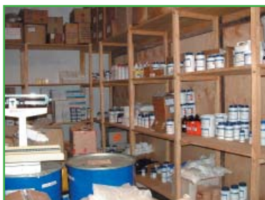
Drug store at the CME Beni pharmacy