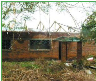
Derelict pharmacy at CME Nyankunde