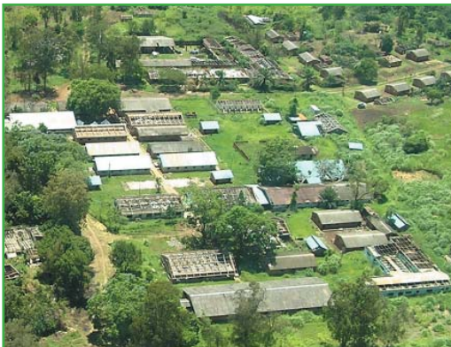
Aerial view of the devastation at Nyankunde in 2002

On September 5th 2002, CME, which for the most part had been un-touched directly by the wars, was attacked. Within half an hour, 1,000 people were murdered including patients, hospital staff and villagers. After days being held hostage at Nyankunde, the remaining patients and staff fled on foot. Most travelled south, walking for two weeks through the rain forest with nothing but the clothes that they were wearing. Mercifully, no more died and 4 babies were born en route! Nyankunde became a 'ghost-town' and the medical centre was looted and largely destroyed.