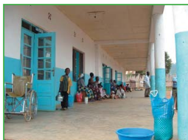
Hospital wards at CME Beni

Other CME staff settled eventually in Bunia to the east where a small hospital has been established. Eventually, people returned to Nyankunde too and CME has restarted its operations. At its three sites, CME now provides over 200 beds and employs over 200 staff including 14 doctors. In the first half of 2009 approximately 4,500 patients were admitted to the three hospitals, 2,000 operations were performed and 10,500 outpatient consultations took place.