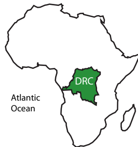
DRC location in Africa