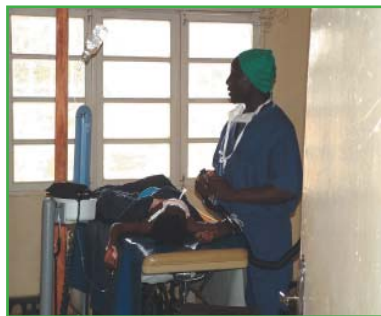
Operating theatre at CME Beni